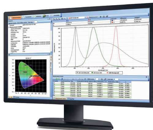
► SpecWin Pro spectral analysis software.

SpecWin Pro and SpecWin Light spectral software packages have been developed for a wide range of interactive semi-automatic and even fully automatic laboratory applications. Each package features comprehensive functions for analysis and documentation of test results.