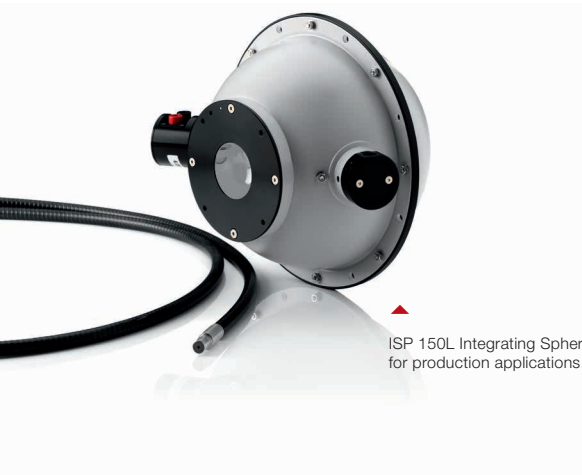
ISP 150L Integrating Sphere for production applications.

fiber-optic measurement adapters for use in the front-end-of-line processes. These probes can be operated under a microscope and permit fast configuration of the wafer and continuous positional control during testing. The probe's high light throughput also facilitates very short measuring times even with low-power LED chips.