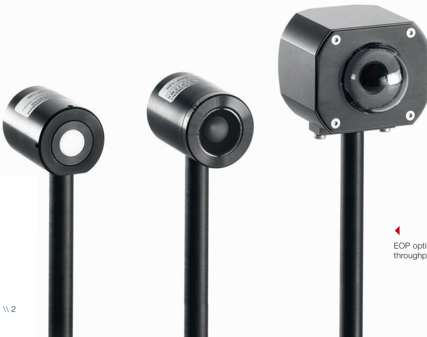
◀ EOP optical probes with different light throughput and angular response characteristic.

Like all spectrometers from Instrument Systems, the CAS 120 can be combined with any of a large number of adapters and other accessories using fiber-optic cables to permit a wide range of different tasks for one spectrometer. This enables the CAS 120 to be deployed efficiently in production, quality assurance, as well as in research and development. The integrated density filter wheel and the dark-current shutter also facilitate fully automated measurements over an extremely broad signal range.