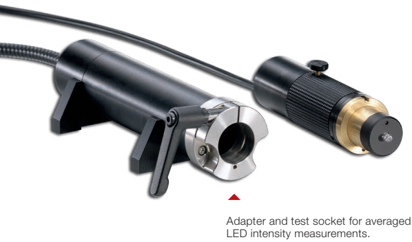
Adapter and test socket for averaged LED intensity measurements.