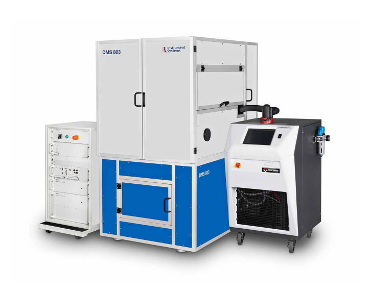
Electronics rack, DMS system and ThermoStream forced-air temperature control unit.

The combination of DMS system and HCS-3B heat-cool system results in a turnkey solution for temperature-dependent measurement of all types of displays. Since only the DUT is exposed to the airflow, the optics and mechanism remain constant at room temperature.